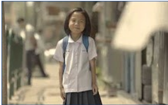
Joy Helping Others

The Catholic Church teaches that solidarity means respect for all and that all deserve “fundamental rights flowing from the dignity intrinsic of the person” (Catechism 1944). We are our brothers’ and sisters’ keepers. We are all dependent upon one another as we all share the same needs and desires: the common good. However, there are great divisions currently in our country and communities that block these rights: between political parties, bias towards people of different religious and racial backgrounds and wide differences in economic status - between wealthy and poor. Only we, as individuals, parishes