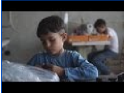
Syrian Refugee Child at Work in Factory

The Catholic Social Principle of the Rights of Workers focuses on the importance of protecting the dignity and rights of workers since it is a form of participating in God's creation. Work must serve people rather than people serve work.