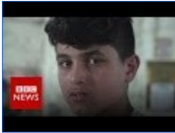
Watch: Syrian Children Working in Turkey

Discussion regarding the rights of refugee children working in Turkey: