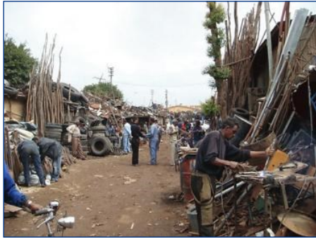
Streets of Eritrea

http://totalitarianimages.blogspot.com El Companero