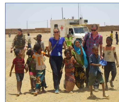
Working with Children