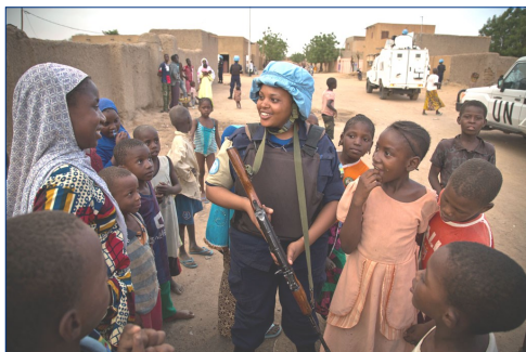
MINUSMA in Mali

One very important aspect of this Catholic social principle teaches us that the right to participate in the economic, political, social and especially the religious life of society and family is a fundamental right for everyone. It is wrong for anyone or group to prevent certain citizens from getting a job, attending a school or worshipping in their chosen church. Indeed, it is a teaching of the Catholic Church that all people are assured a minimum level of participation in their community institutions. Our failure to do this says that some people count less than others.