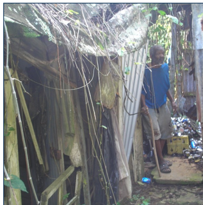
Homeless man living in shack in Jamaica

Although the Church calls this theme of Catholic Social Teaching the “ Option for the Poor and Vulnerable,” there isn’t anything optional about it. Jesus teaches us to put the needs of the poor first, and spent much of his life demonstrating his special love for the poor by caring for the sick and outcast. In fact, it is so important to Jesus that we follow his example by putting the needs of the most vulnerable members of society before our own, that it is the basis on which we will be judged (Matt 25:31-46).