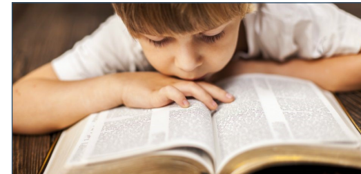
Child discovering the Good News from the Apostle Paul