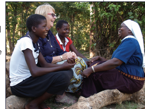
Enjoying Encounter in Tanzania

grants of support can gather together and share their experiences, their struggles, their growth and their new opportunities for the future.