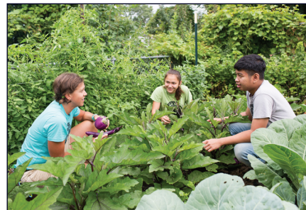
Urban Roots Garden: CCHD Grant

Organizations receiving grants are carefully vetted and must align themselves with Catholic social teachings and principles. They are mostly organizations that have been started by poor and struggling individuals themselves and have boards that represent those they serve.