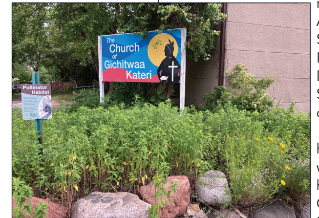
Pollinator Garden at Kateri Parish

trouble to provide opportunities for human flourishing all in the spirit of recognizing the dignity of all. Our relationship has been enhanced through the help we have provided the Archeparchy and the blessings and prayers they have provided for us: dignity of each other.