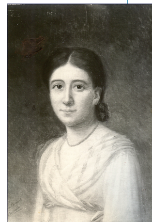
Blessed Pauline Jaricot

In this newsletter, we highlight opportunities to learn about and participate in the Church's social mission.